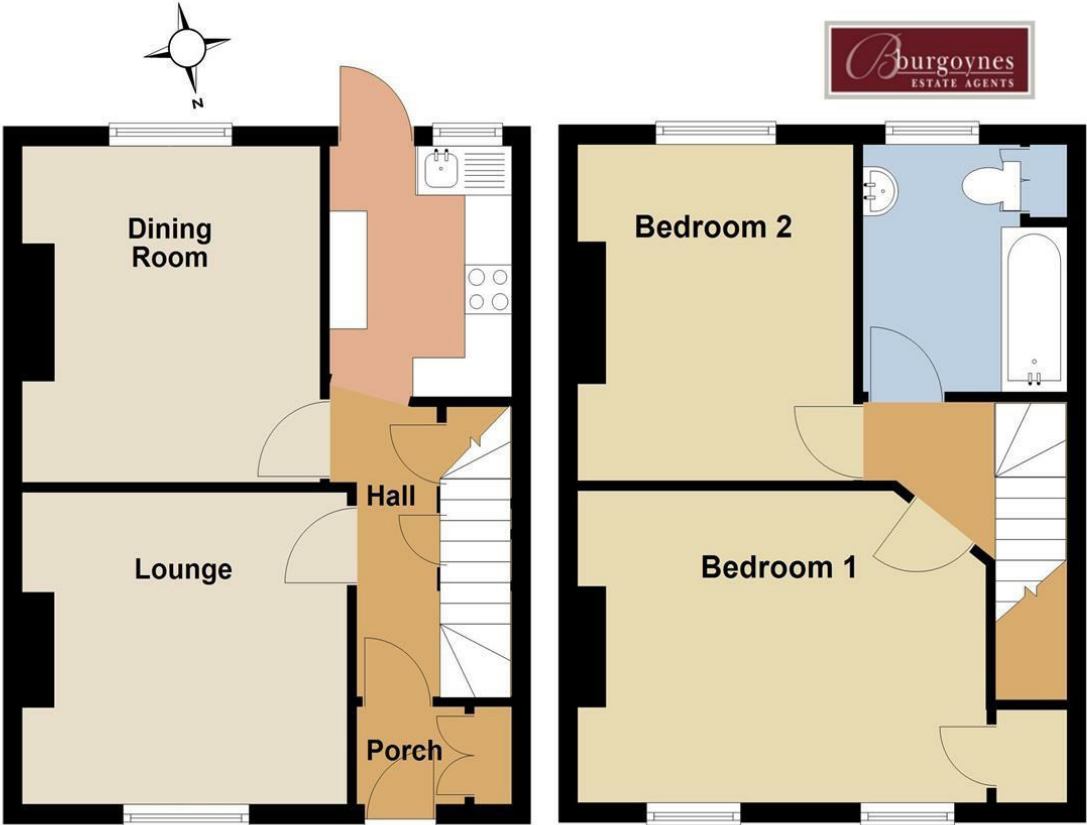
Ground Floor First Floor Total area: approx. 69.9 sq. metres (752.7 sq. feet)

Please note that whilst every attempt has been made to ensure the accuracy of this plan, all measurements are approximate and not to scale. This floor plan is for illustrative purposes only and no responsibility is accepted for any other use.